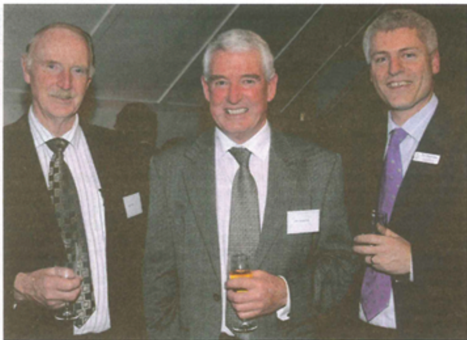
Mayors and MPs: Matamata-Piako District Mayor Hugh Vercoe, Waipa District Mayor Alan Livingstone and National MP for Hamilton West Tim Macindoe.